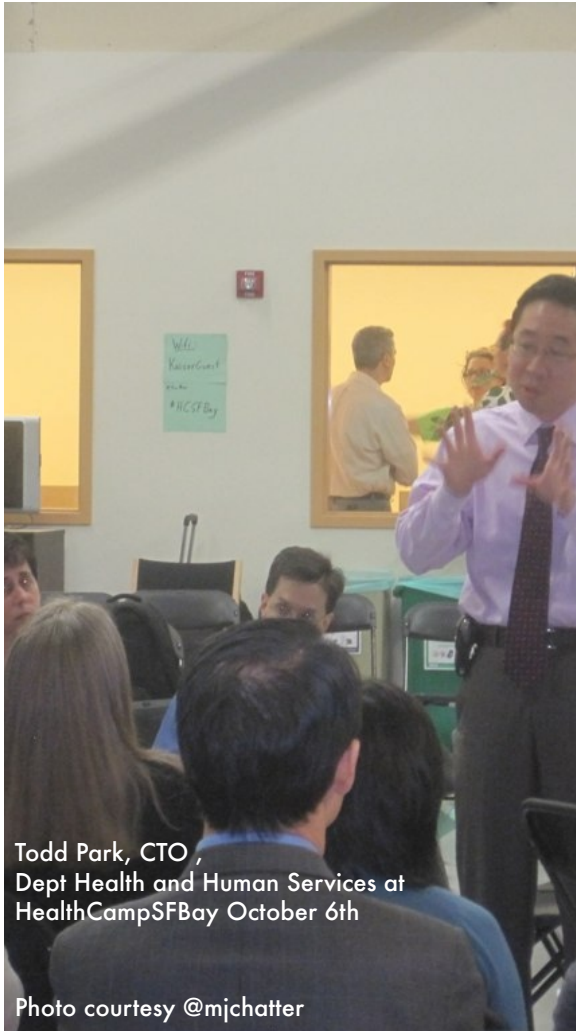
Todd Park, CTO, Dept Health and Human Services at HealthCampSFBay October 6th

Discussions cover topics such as Participatory healthcare, diet and vitality, the use of Social Media in healthcare and mHealth. Multiple sessions run in parallel. The meeting space will allow for 3-6 sessions of different sizes to take place concurrently.